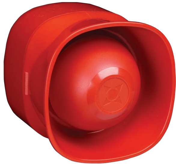
MLC624 low current sounder