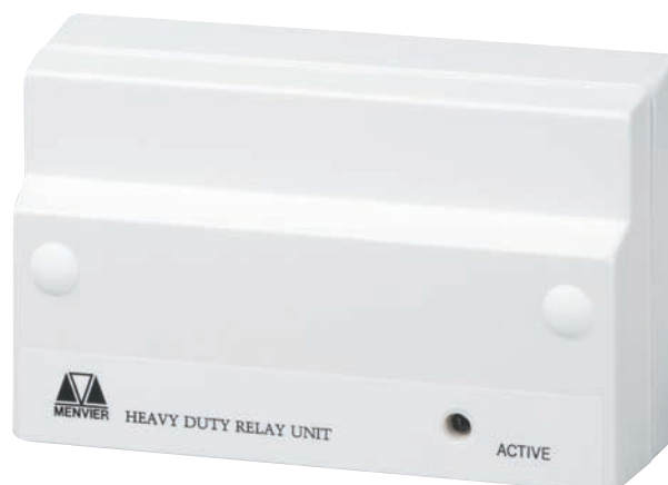
MAR724 heavy duty relay