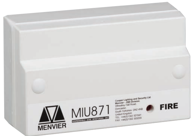
MIU871 zone monitor unit