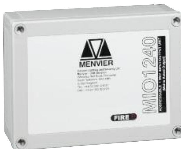
MIO1240 relay unit