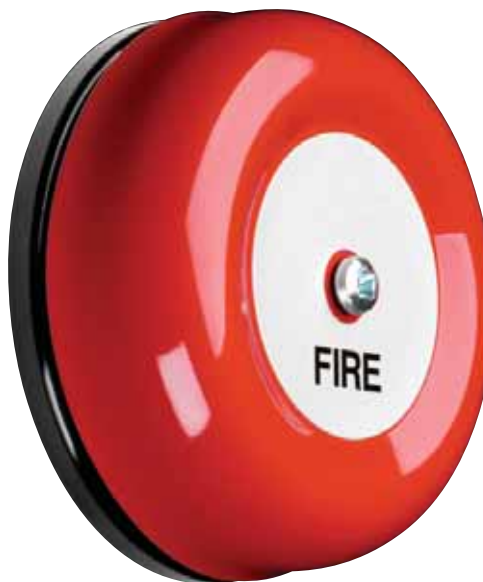
MBM246 internal bell