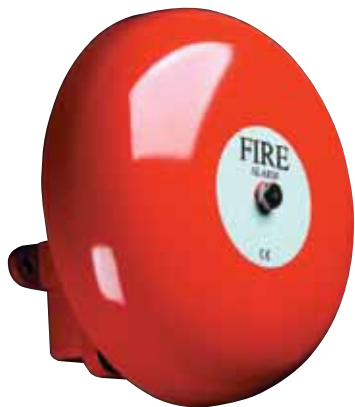
MWB824 weatherproof bell