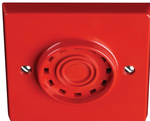
MFS324 red flush sounder