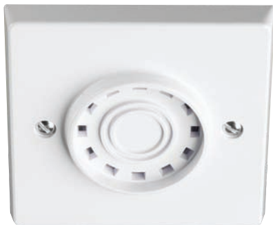
MFS324W white flush sounder