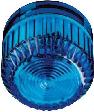
FX004B low profile xenon beacon, blue lens