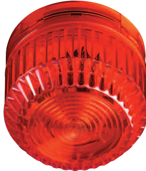
FX004R low profile xenon beacon, red lens